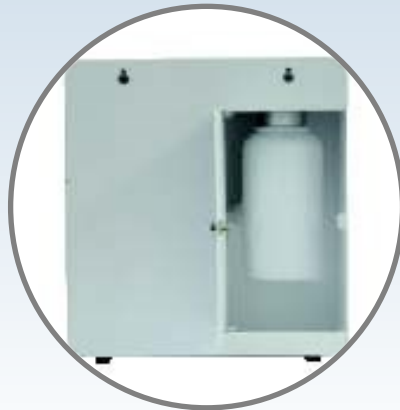
Lockable Front Door